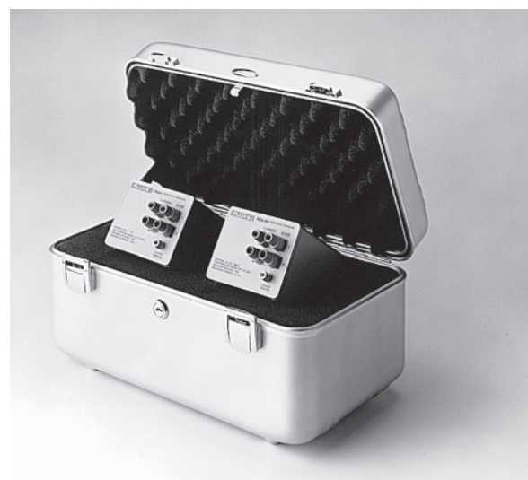
Optional 742A-7002 transit case

Fluke. Keeping your world up and running.